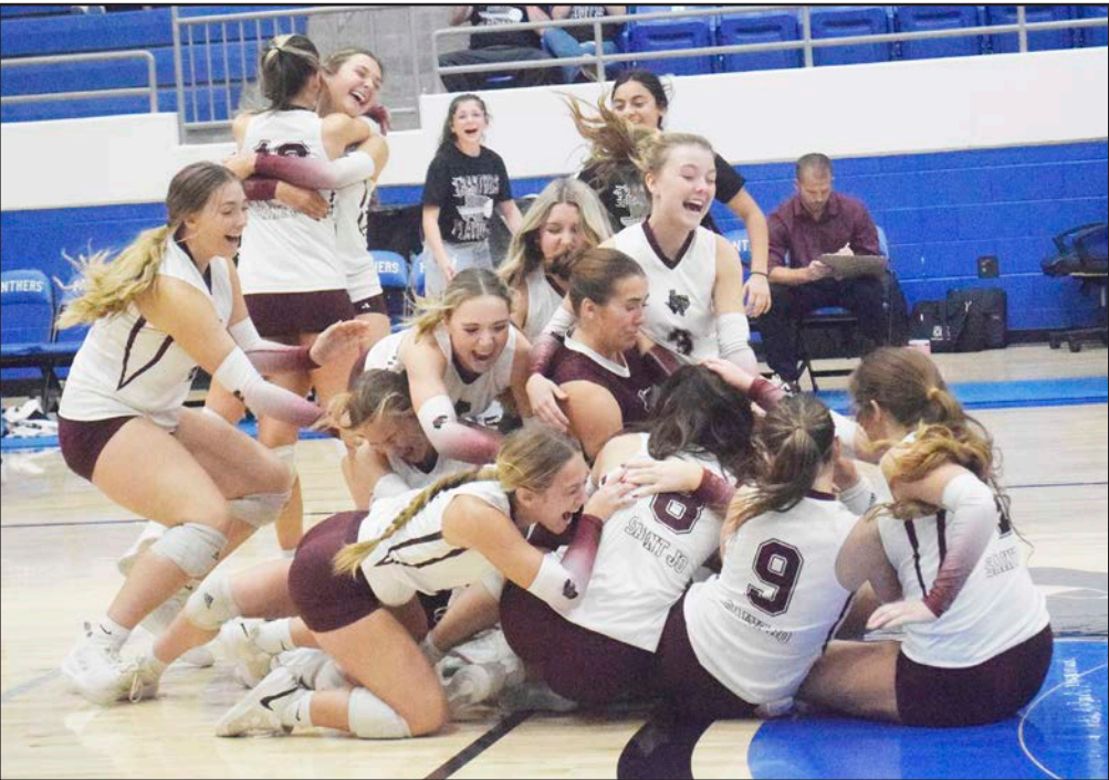
It was not all a bad trip as Saint Jo celebrated after winning against Evant on Friday.