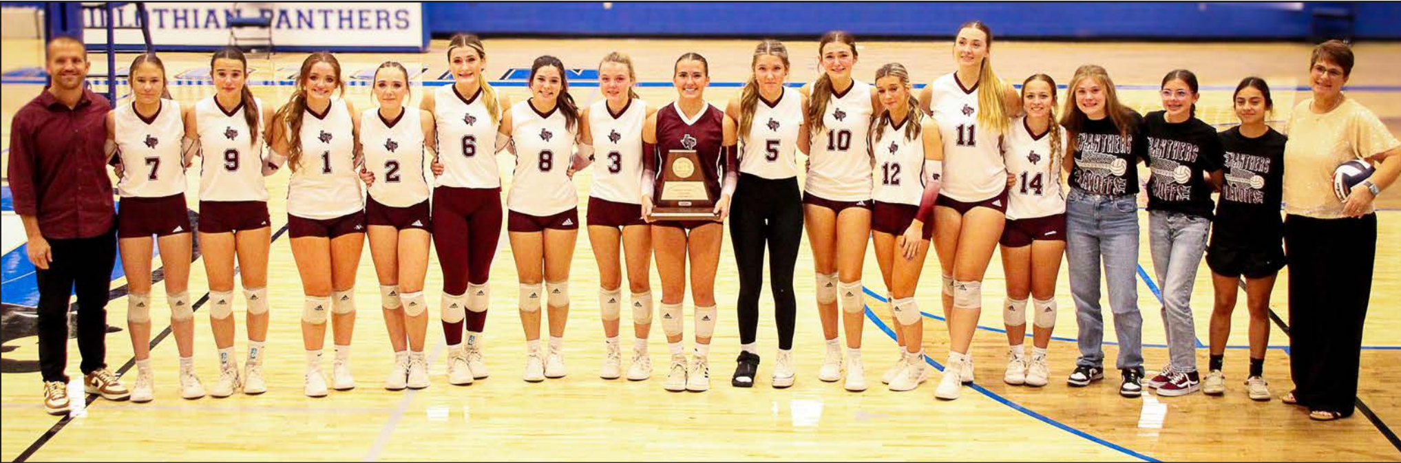
The Saint Jo Lady Panthers were regional finalist runners-up for the third consecutive season as six seniors fought through tears after they played their final match for Saint Jo.